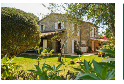
Selva Objekt-Nr. 077793

PORTA MALLORQUINA® Your home. Our passion.