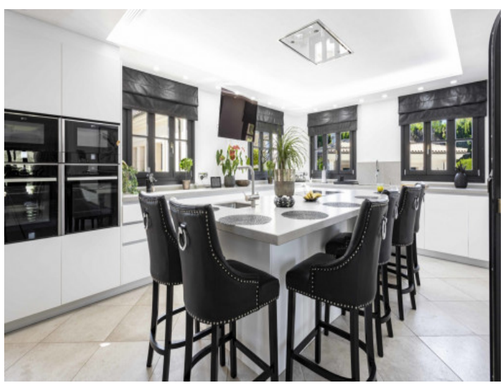
All information is correct to the best of our knowledge. Errors and prior sale excepted. This prospectus is purely for information purposes. Only the notarized deed of sale is legally binding.