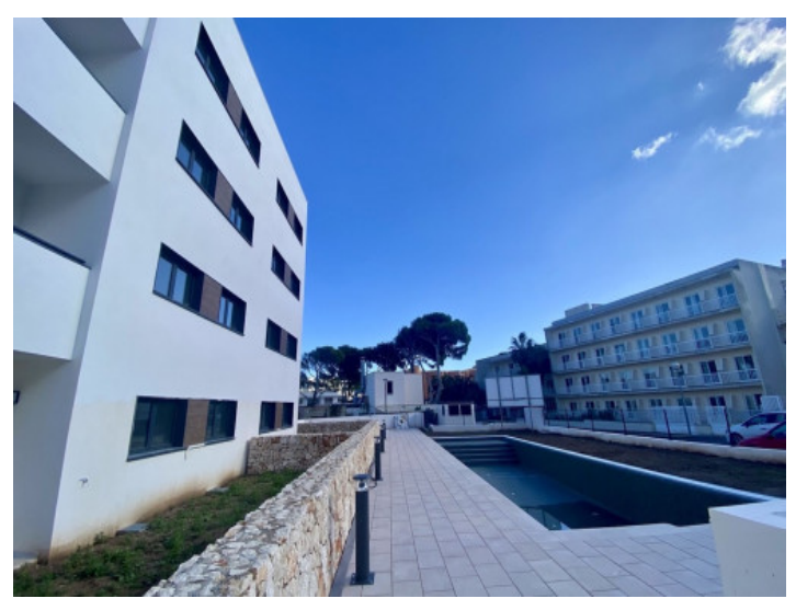
NAMATHICA THE CHITETERS