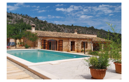
Inca Objekt-Nr. 077874

PORTA MALLORQUINA® Your home. Our passion.