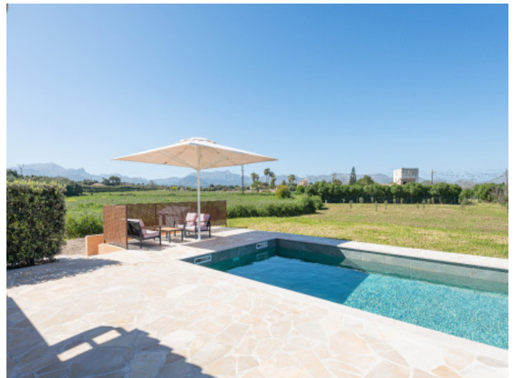
Pool with Views of Rural Serenity