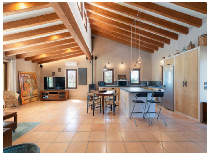
Open Kitchen with Natural Warmth

All information is correct to the best of our knowledge. Errors and prior sale excepted. This prospectus is purely for information purposes. Only the notarized deed of sale is legally binding.