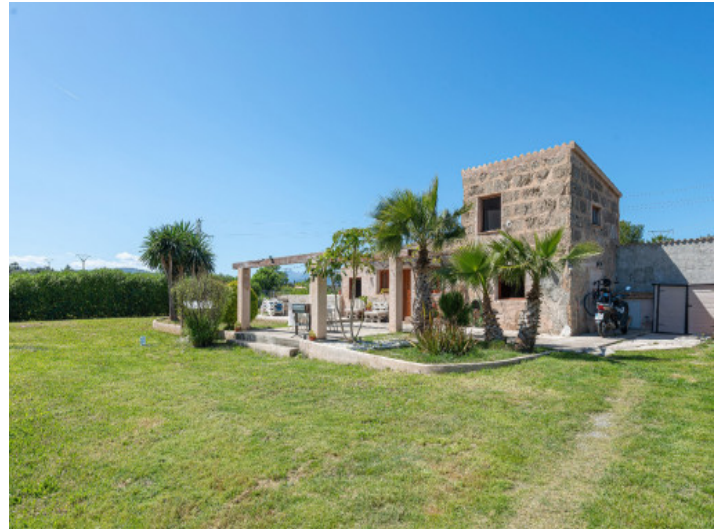
Stone House with Mallorcan Soul