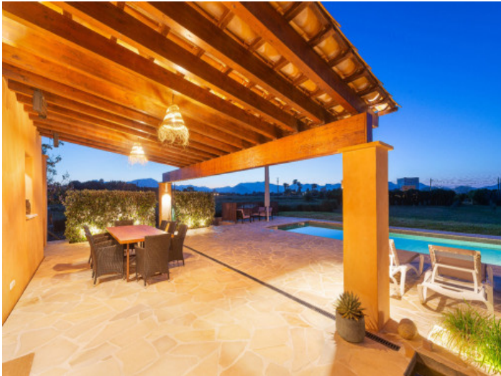
Natural Light Meets Eco Design