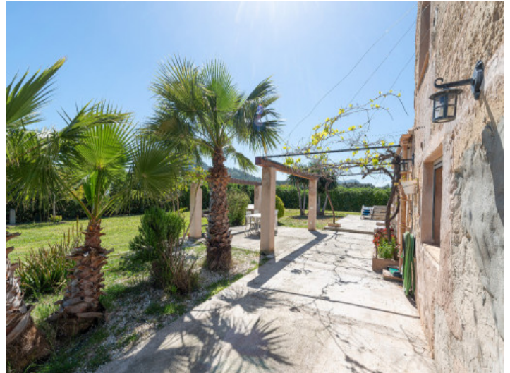
Mediterranean Terrace by the Guest House