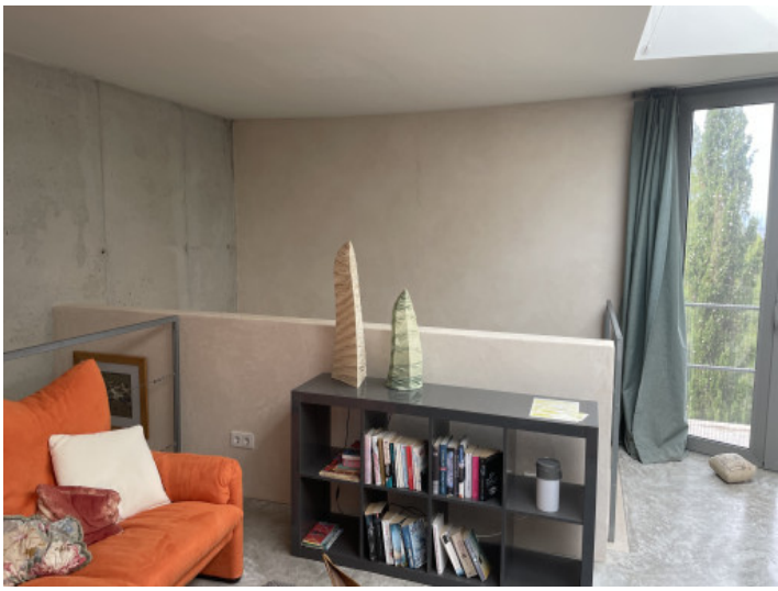
Hall Living room