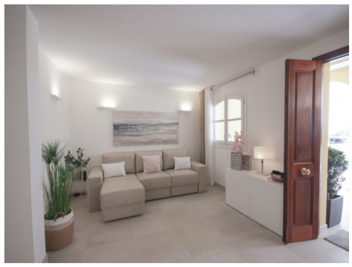
All information is correct to the best of our knowledge. Errors and prior sale excepted. This prospectus is purely for information purposes. Only the notarized deed of sale is legally binding.