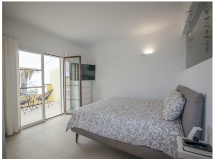
All information is correct to the best of our knowledge. Errors and prior sale excepted. This prospectus is purely for information purposes. Only the notarized deed of sale is legally binding.