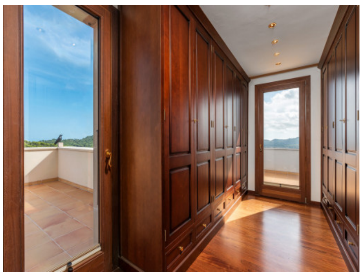
All information is correct to the best of our knowledge. Errors and prior sale excepted. This prospectus is purely for information purposes. Only the notarized deed of sale is legally binding.