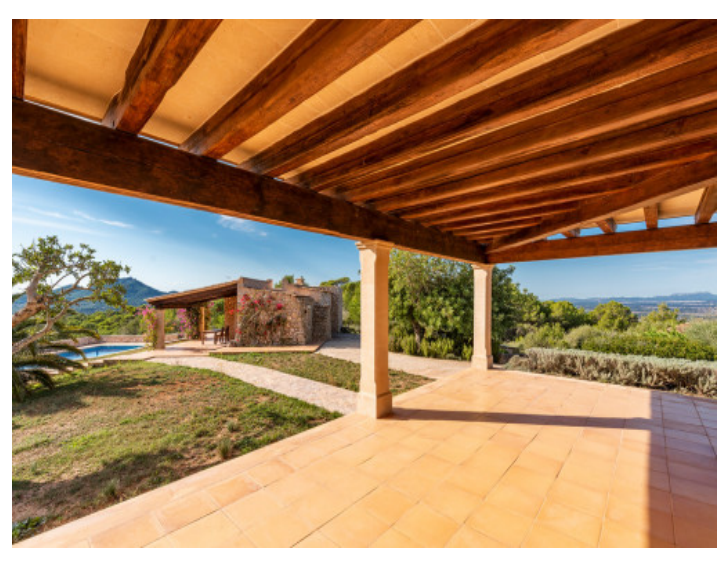
All information is correct to the best of our knowledge. Errors and prior sale excepted. This prospectus is purely for information purposes. Only the notarized deed of sale is legally binding.