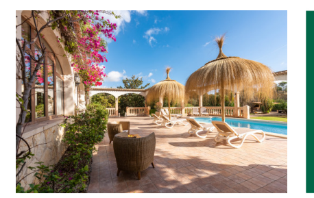
Selva Objekt-Nr. 119206

PORTA MALLORQUINA® Your home. Our passion.