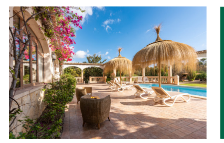
Selva Objekt-Nr. 119206