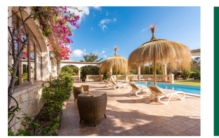
Selva Objekt-Nr. 119206

PORTA MALLORQUINA® Your home. Our passion.