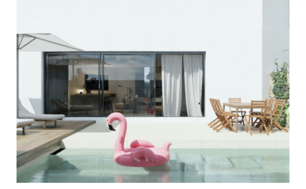
Molinar Objekt-Nr. 119724

PORTA MALLORQUINA® Your home. Our passion.