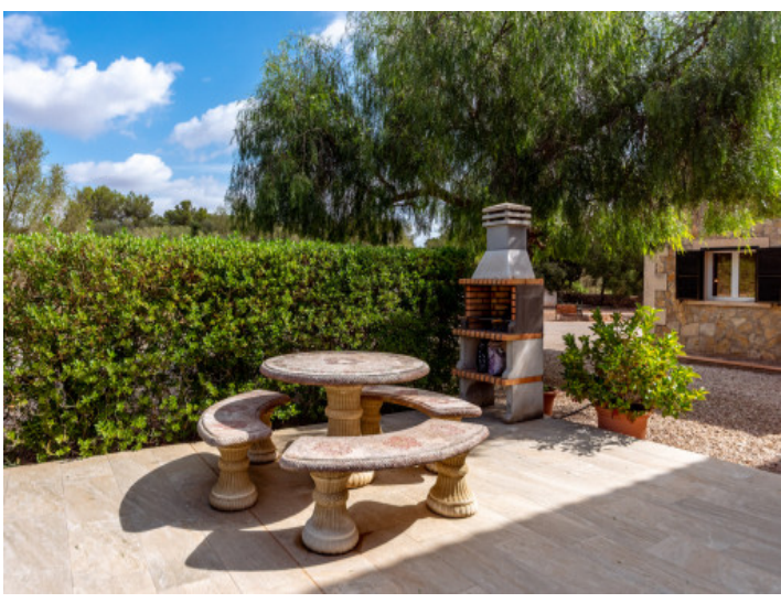
All information is correct to the best of our knowledge. Errors and prior sale excepted. This prospectus is purely for information purposes. Only the notarized deed of sale is legally binding.