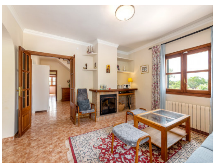
All information is correct to the best of our knowledge. Errors and prior sale excepted. This prospectus is purely for information purposes. Only the notarized deed of sale is legally binding.