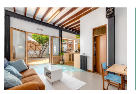
Palma City Objekt-Nr. 121410

PORTA MALLORQUINA® Your home. Our passion.