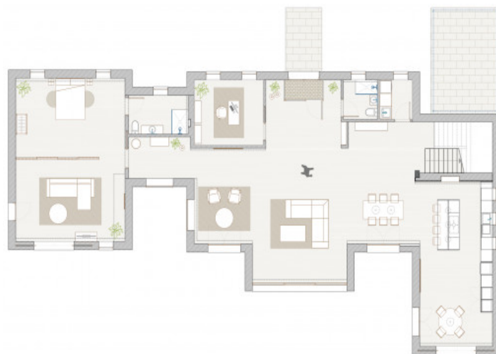
GROUND FLOOR PLAN E.176

All information is correct to the best of our knowledge. Errors and prior sale excepted. This prospectus is purely for information purposes. Only the notarized deed of sale is legally binding.