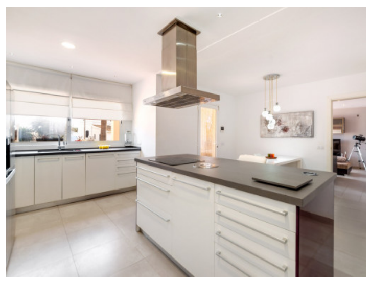
All information is correct to the best of our knowledge. Errors and prior sale excepted. This prospectus is purely for information purposes. Only the notarized deed of sale is legally binding.