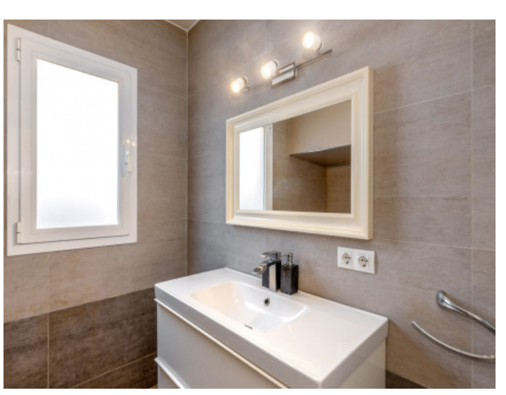
All information is correct to the best of our knowledge. Errors and prior sale excepted. This prospectus is purely for information purposes. Only the notarized deed of sale is legally binding.