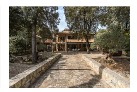
Sa Pobla Objekt-Nr. 122181