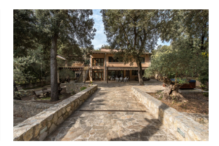
Sa Pobla Objekt-Nr. 122181