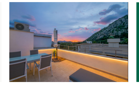
Pollensa Objekt-Nr. 122204