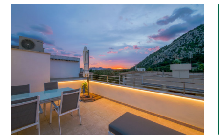
PORTA MALLORQUINA® Your home. Our passion.